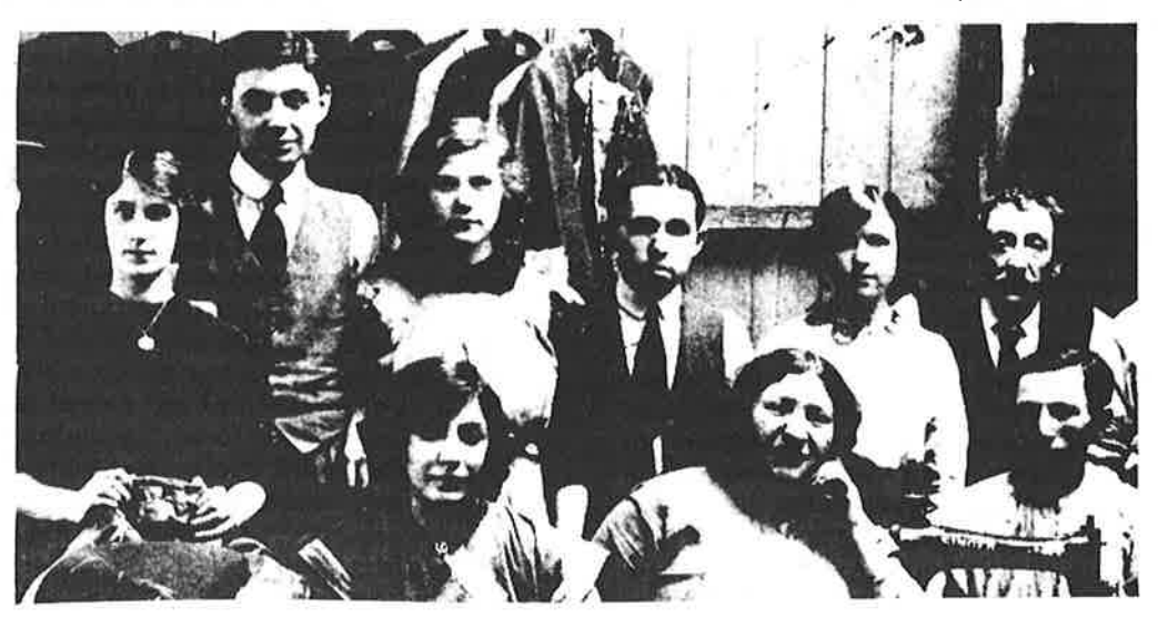
Prior to WW1, many Jewish women worked in tailoring. This is a Manchester Workshop.

The same problems existed with respect to records of the wider Manchester community and in 1974 the Manchester Studies Unit was founded as a research team concerned to recover, preserve and communicate the history of working people in Manchester. An active programme of archive retrieval was initiated and, as a result of newspaper